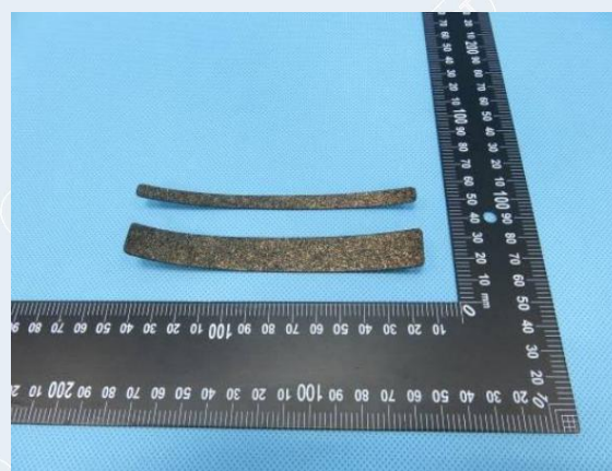
Reference Sample (Reverse)