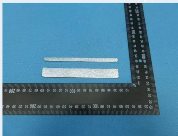
Reference Sample (Reverse)